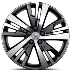
18" DETROIT Two tone finish diamond cut alloy wheels (Standard on GT PETROL)