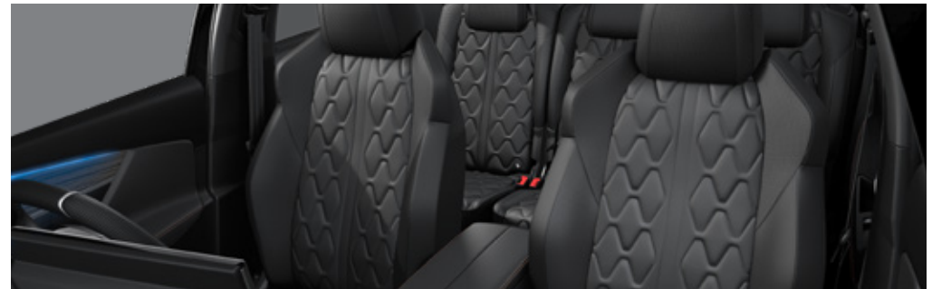
FULL GRAIN NAPPA LEATHER TRIM 2 (Optional on GT)

Note: Paint colours are representative only and subject to variation due to the printing process. 1. Optional extra. 2. Leather appointed seats are a combination of genuine leather & synthetic materials and are not wholly leather.