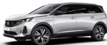
PEARL WHITE 1