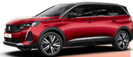
ULTIMATE RED 1