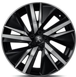
19" WASHINGTON Onyx black finish diamond cut alloy wheels (Standard on GT DIESEL)