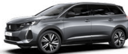
ARTENSE GREY 1