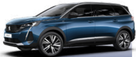
CELEBES BLUE 1