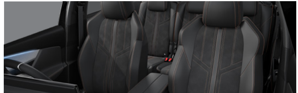
LEATHER EFFECT / ALCANTARA® (Standard on GT)