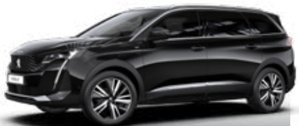
NERA BLACK 1