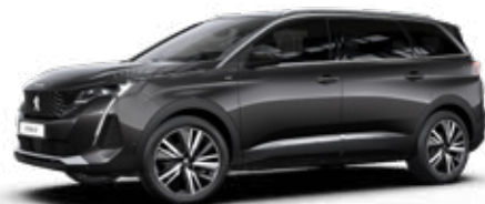
PLATINUM GREY 1