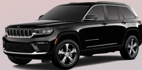
PXJ - Diamond Black (Option)