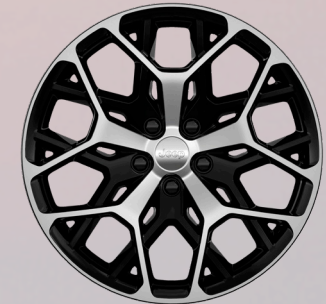
WJA - 21-inch Machined / Painted Alloy Wheels (Standard on Summit Reserve 4xe)