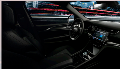
DZX7 - Black Suede & TechnoLeather - accented trim (Standard - Night Eagle)