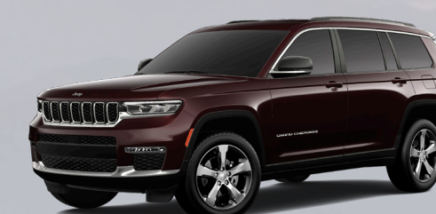
PHC - Ember (Option - 7 seat only)