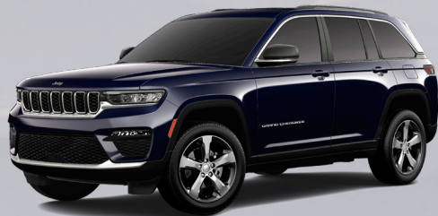
PCQ - Midnight Sky (Option)