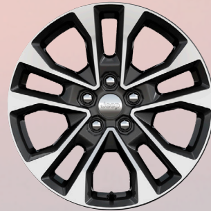
WLJ - 20-inch Full Polished Alloy Wheels (Standard on Overland)