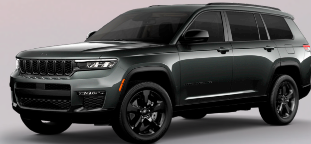
7 seat Night Eagle