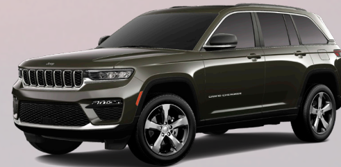
PFJ - Rocky Mountain (Option)