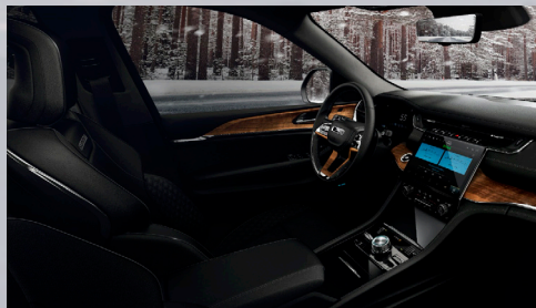
ECX7 - Black Palermo Leather-trim (Standard - Summit Reserve)