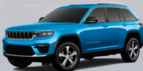
PBJ - Hydro Blue (Option - 5 seat only)