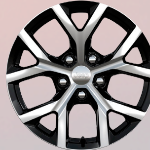
WLH - 18-inch Full Polished / Painted Alloy Wheels (Optional on Overland)