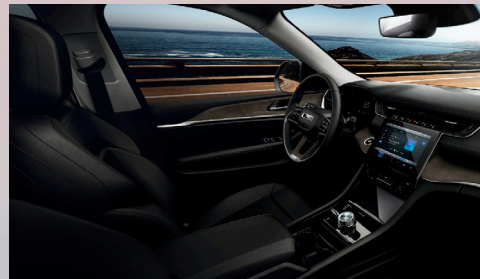
D6X7 - TechnoLeather trim (Standard - Limited)