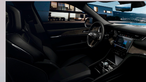
BLX7/TLX7 - Black Nappa Leather-trim (Standard - Overland)