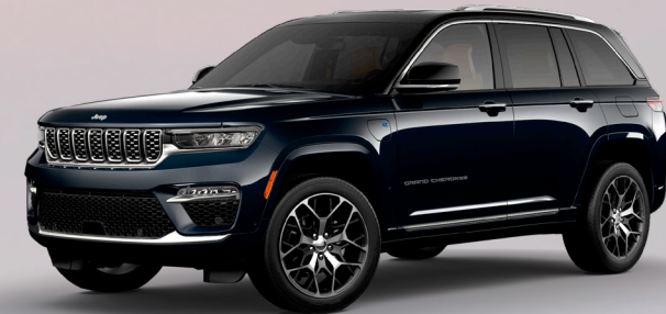
5 seat Summit Reserve 4xe