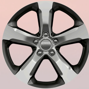
WHG - 20-inch Machined / Painted Alloy Wheels (Standard on Limited)