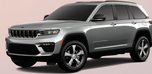
PSE - Silver Zynith (Option)