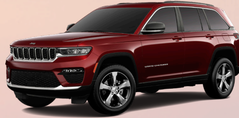
PRV - Velvet Red (Option)