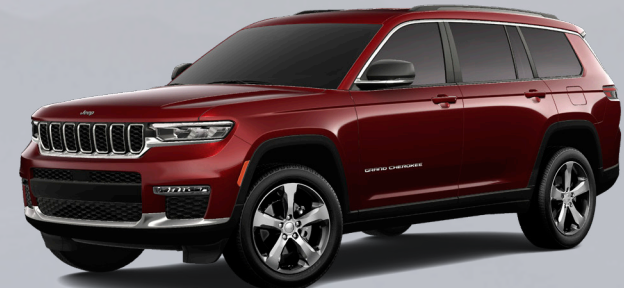
7 seat Limited