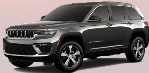
PAS - Baltic Grey (Option)