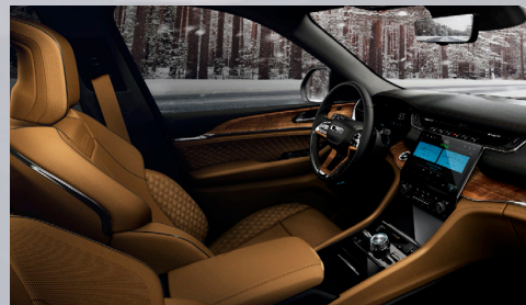
ECT7 - Tupelo Palermo Leather-trim (Option - Summit Reserve)