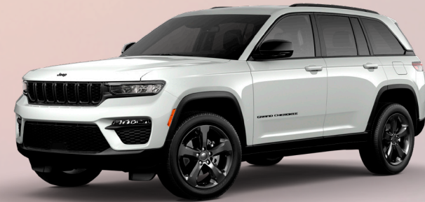
5 seat Night Eagle