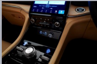
Electric Brake Controller