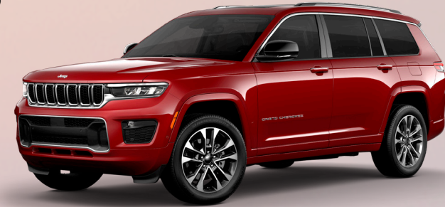
7 seat Overland