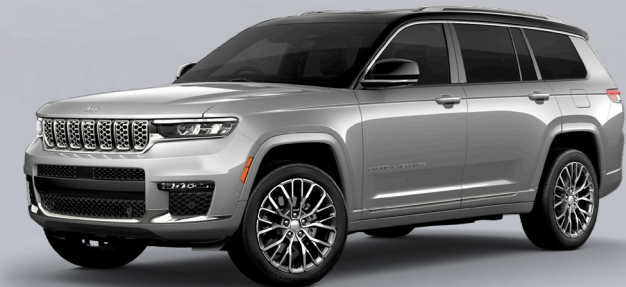
7 seat Summit Reserve