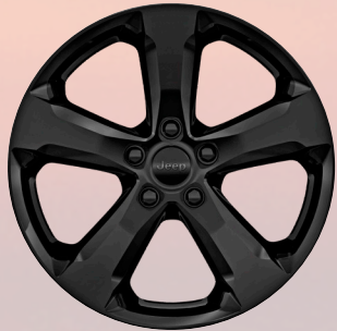
WHF - 20-inch Gloss Black Painted Alloy Wheels (Standard on Night Eagle Optional on Limited)