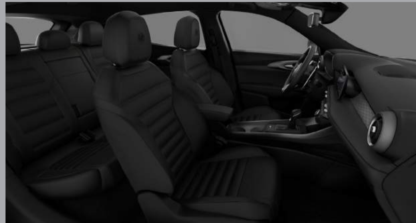
428 Perforated Black Leather-Accented Seats with Embroidered Alfa Romeo Logo and Dark Grey Double Stitching (Option on Veloce Hybrid, Standard on Veloce Plug-In Hybrid Q4)