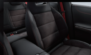
Microfiber sports-style seats