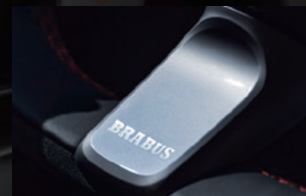
BRABUS Steering Wheel