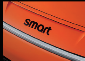
Sporty front hood with glossy black logo