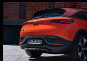
Sporty spoiler BRABUS package element