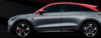
Atom Grey – Matte