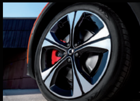
20-inch extra large sporty wheels Pair with red sporty caliper