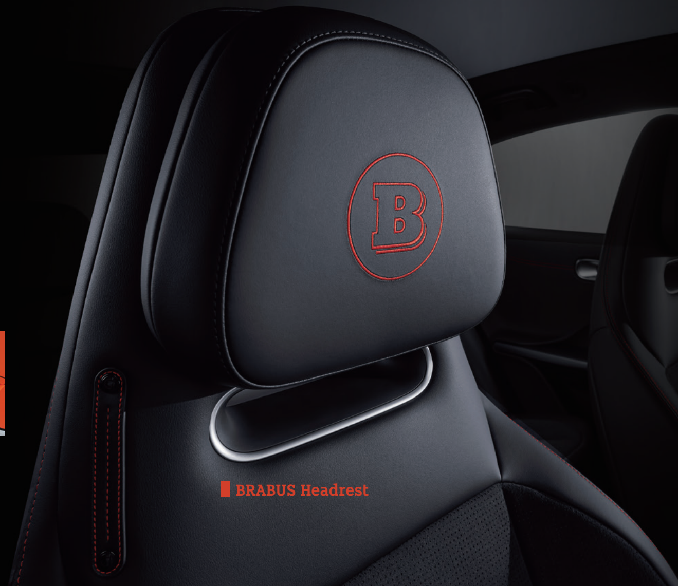
■ BRABUS Headrest