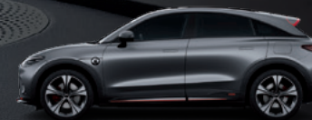
Atom Grey – Matte