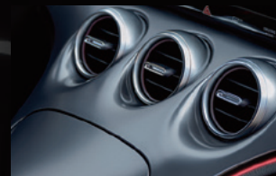
Turbine-style air vents