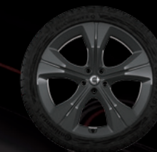
20' Synchro 245/40 R20

*The roof colour and the body colour are fixed combinations, the body colour and the interior theme are fixed combinations. In case of any discrepancy please refer to manufacturer's original specifications.